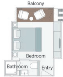
Panorama Balcony Suite