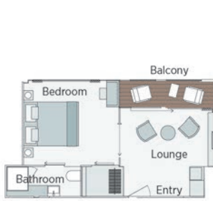
Owner's One-Bedroom Suite