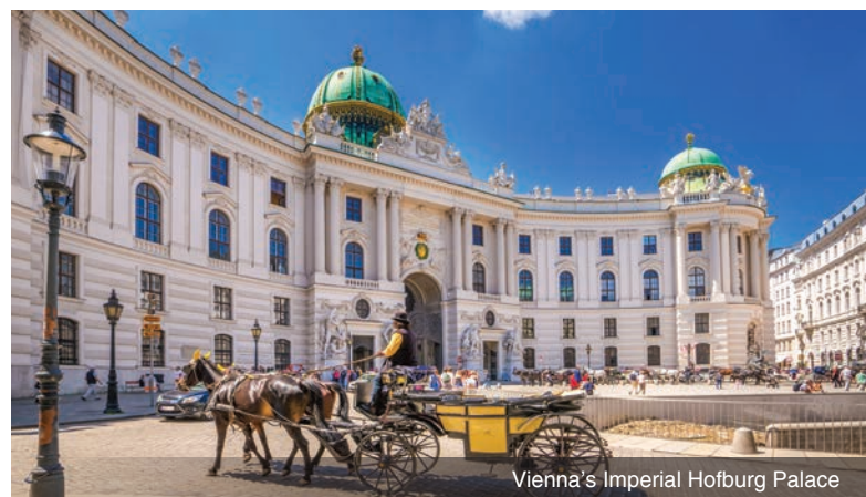
Vienna's Imperial Hofburg Palace

DAY 9 Bratislava, Slovakia: Today you sail into the capital of Slovakia. This graceful nation became an independent country in 1993, and since then, Bratislava has flourished as a new capital and made a name for itself as a cultural center. The romantic cobblestone lanes that weave through the city are explored with your local guide as you enjoy a walking tour of the ancient town center, seeing the Slovak National Theatre and a range of Gothic and Art Nouveau buildings. For the more active guests, embark on a guided hike to Bratislava Castle, a landmark steeped in legends that looks as though it came from the pages of a fairytale book. Meals: B, L, D EmeraldACTIVE: A guided hike to Bratislava Castle (instead of walking tour) DiscoverMORE: Carpathian Wine Route (additional expense) EmeraldPLUS: Local Slovakian entertainment onboard DiscoverMORE: Skoda tour of post-Communist Bratislava (additional expense)