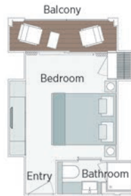
Grand Balcony Suite