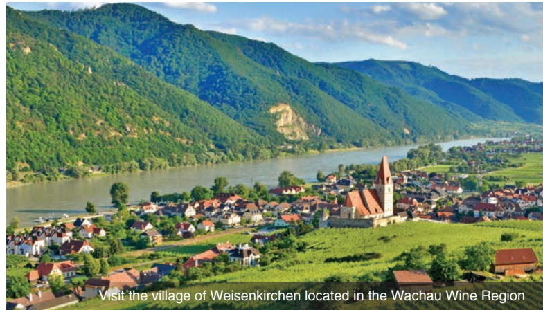
Visit the village of Weissenkirchen located in the Wachau Wine Region

DAY 1 Depart the USA: Depart the USA on your overnight flight to Prague, Czech Republic.