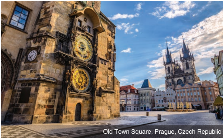
Old Town Square, Prague, Czech Republic